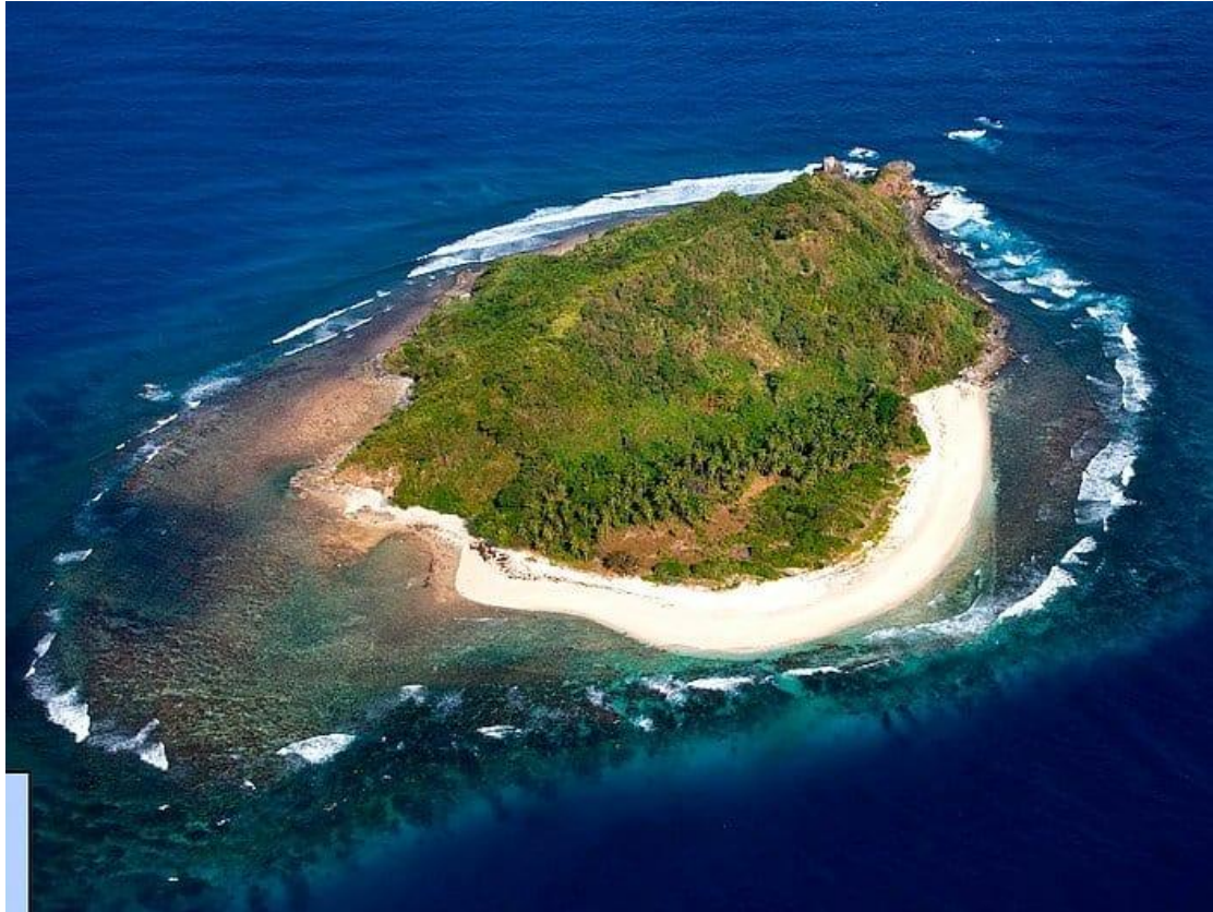
Bolina island, one of the several ones you can rent for yourselves and camp out on alone.

One good thing about customizing your own tour, besides the ability to evade the crowds and group tours, is that you can choose from a variety of accommodation. From air-conditioned hotels, to beach huts, to camping on a deserted island – the world is your oyster.